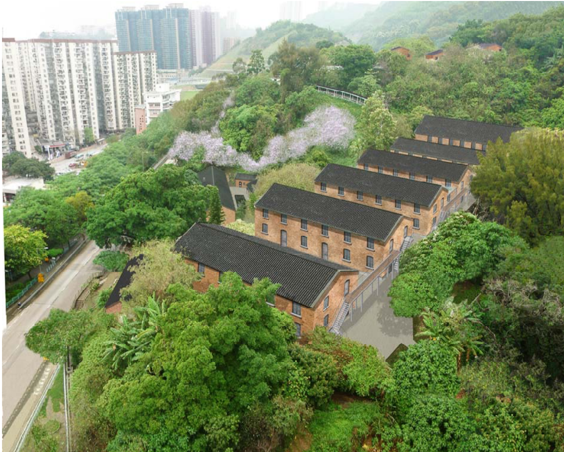
Overall view of the Academy