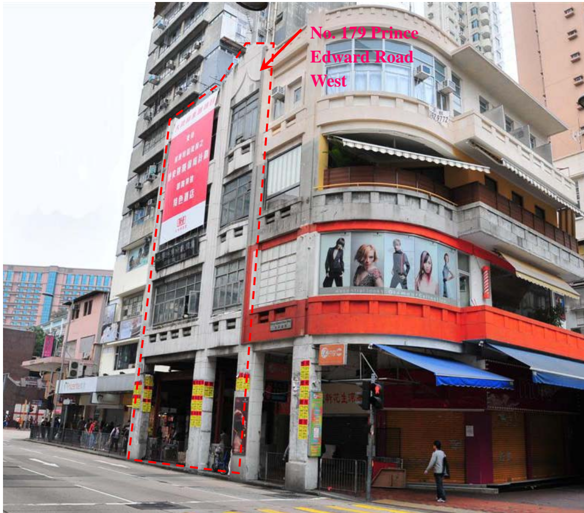
Front view of the existing shophouse