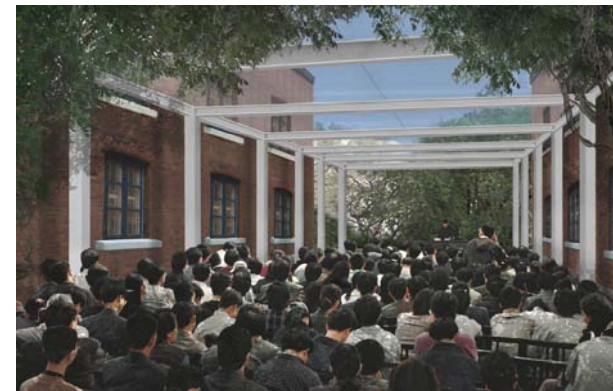
Covered outdoor performance stage & outdoor activities area