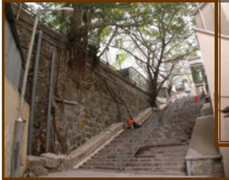
現存的擋土牆，以及沿荷李活道和城隍街及 位於該址下層平台的獨特樹木 Retaining walls & trees along Hollywood Road & Shing Wong Street