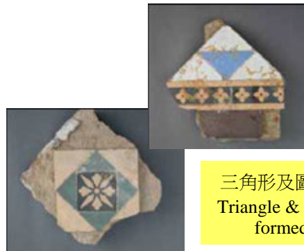
三角形及圖案瓷磚組合 Triangle & encaustic tiles formed patterns