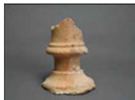
素面欄杆殘件 Fragment of plain baluster