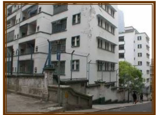
沿士丹頓街和鴨巴甸街的圍牆上的 原有花崗石基座和柱 Granite plinths & pillars of fenced walls along Staunton Street & Aberdeen Road