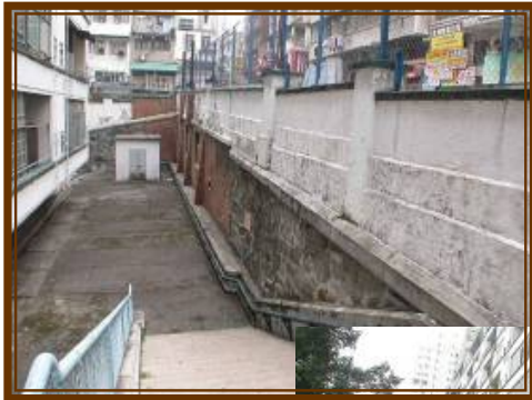
通往下層平台的花崗石級， 以及餘下的毛石牆 Granite steps leading to lower platform together with the remaining rubble wall