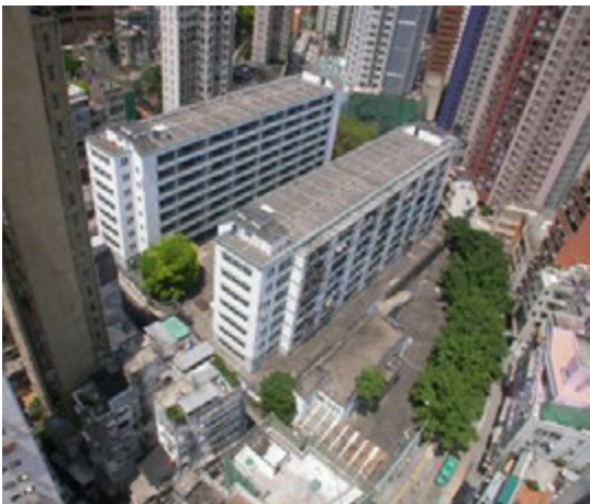
前荷李活道已婚警察宿舍 Former Police Married Quarters at Hollywood Road

荷李活道前中央書院遺址, 即現時前荷李活道已婚警察宿舍的位置, 該址四邊為荷李活道、士丹頓街、鴨巴甸街、和城隍街, 面積約 6 000 平方米。該址有兩幢前已婚警察宿舍大樓和一座曾用作少年警訊會所的建築物。