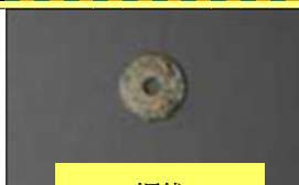
銅錢 Bronze coin