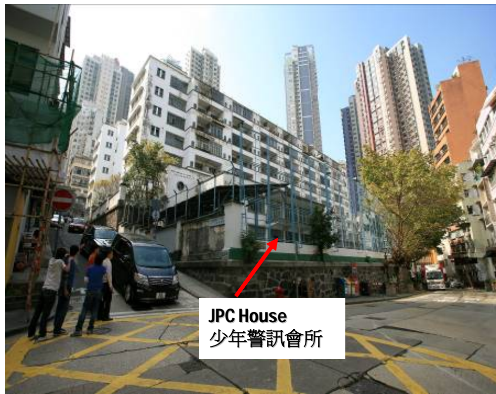
Uphill Elevation on Hollywood Road 從荷李活道上望的仰視立面