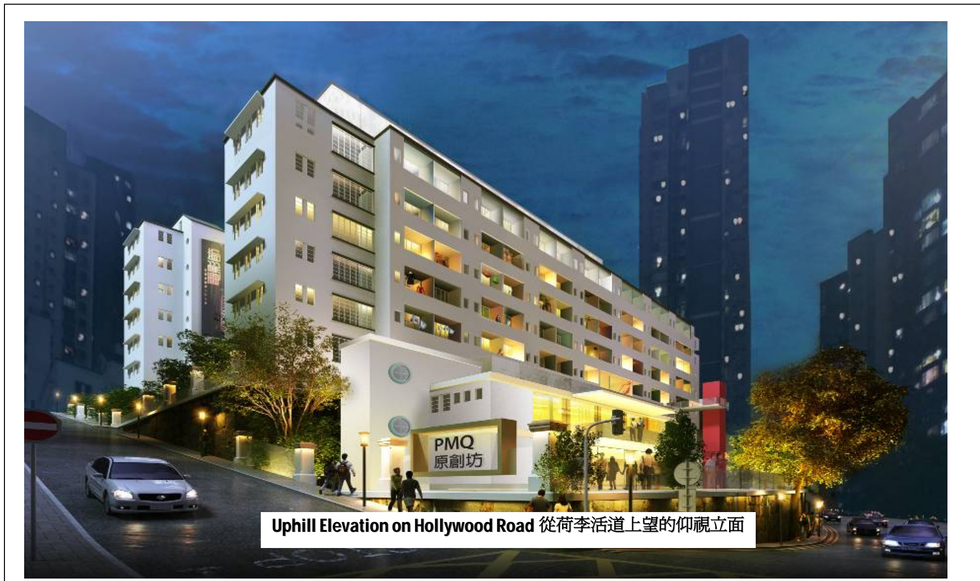
Uphill Elevation on Hollywood Road 從荷李活道上望的仰視立面