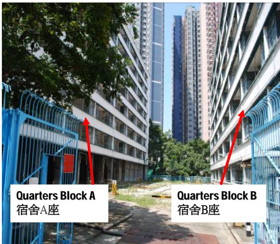
Central Courtyard Inside Elevation 中庭的內視立面