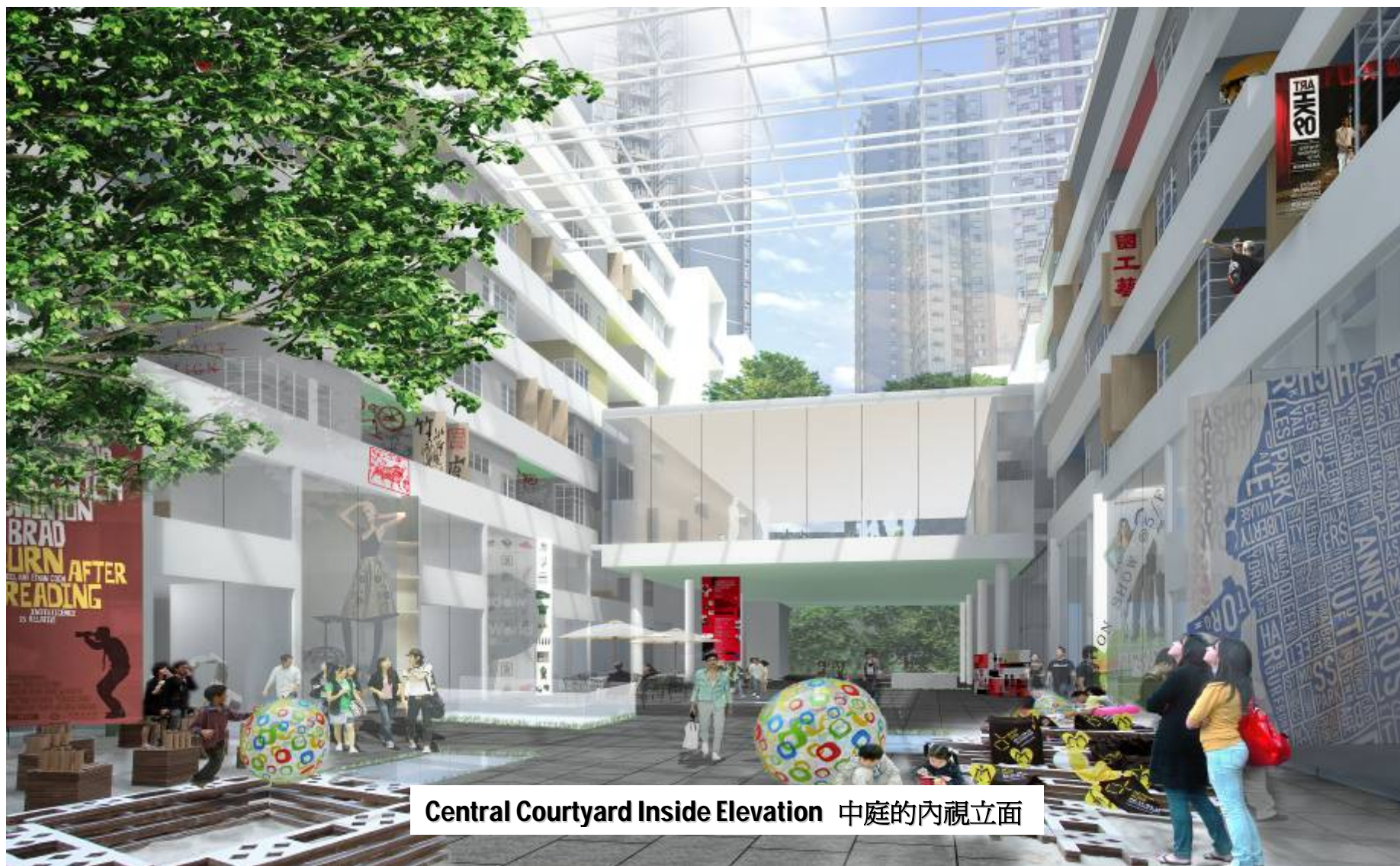
Central Courtyard Inside Elevation 中庭的內視立面