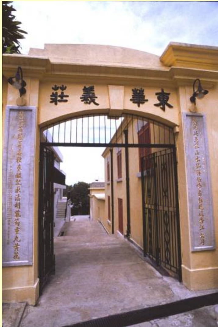
Tung Wah Coffin Home