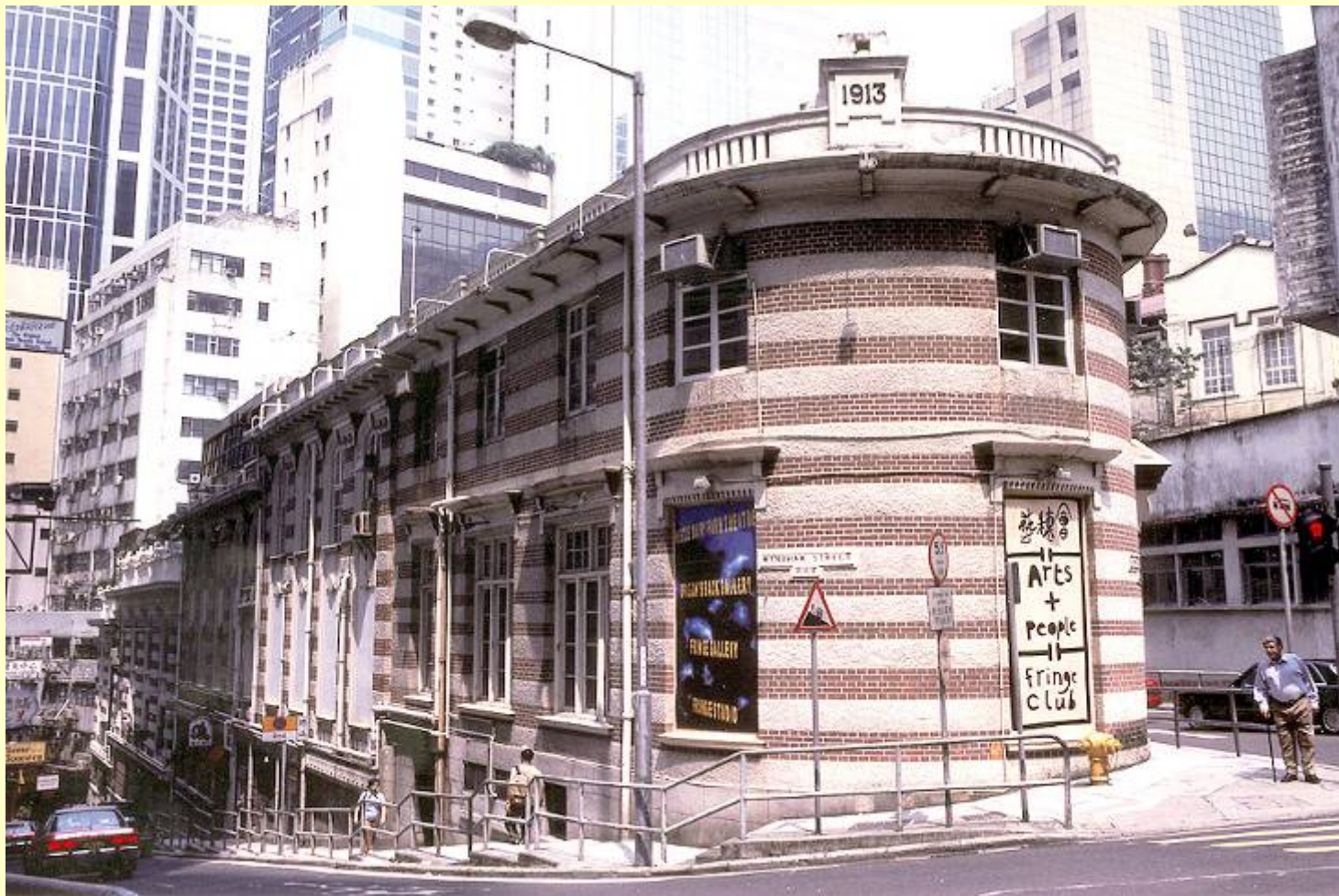
Grade II Historical Building: Old Dairy Farm Building (now houses the Fringe Club)