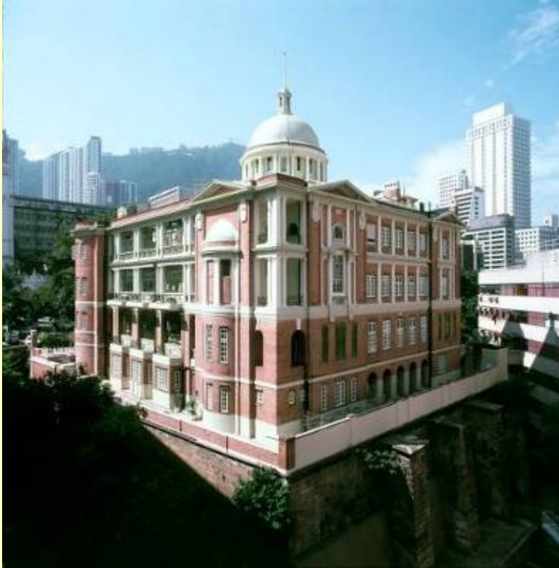
Former French Mission Building (now houses Final Court of Appeal)