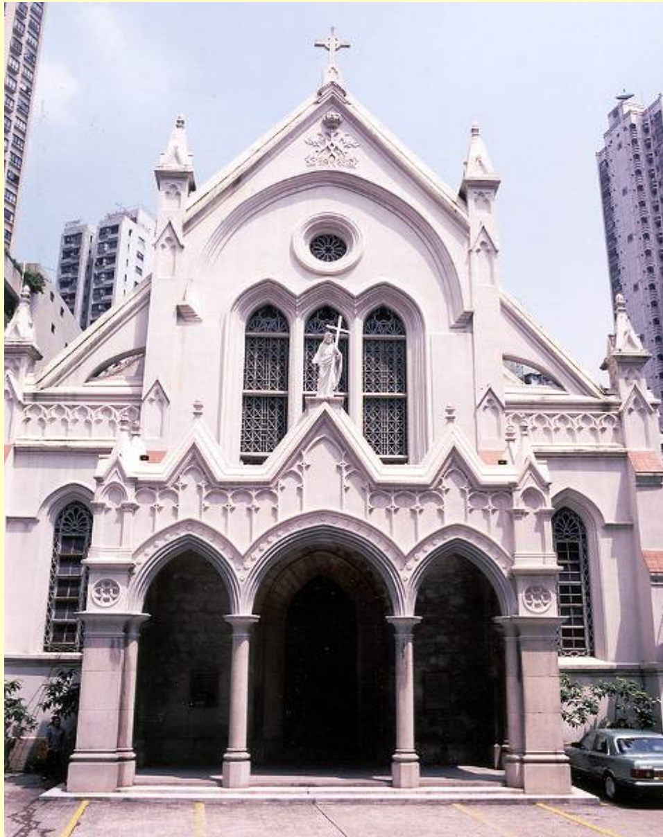
Grade I Historical Building: Catholic Cathedral of Immaculate Conception