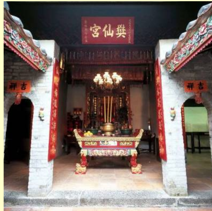
Fan Sin Temple