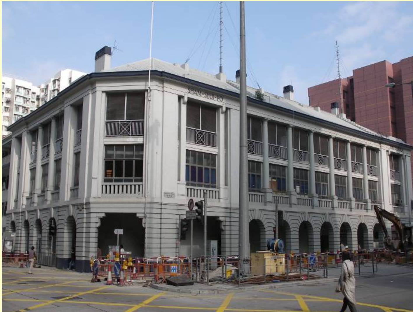
Grade III Historical Buildings: Sham Shui Po Police Station