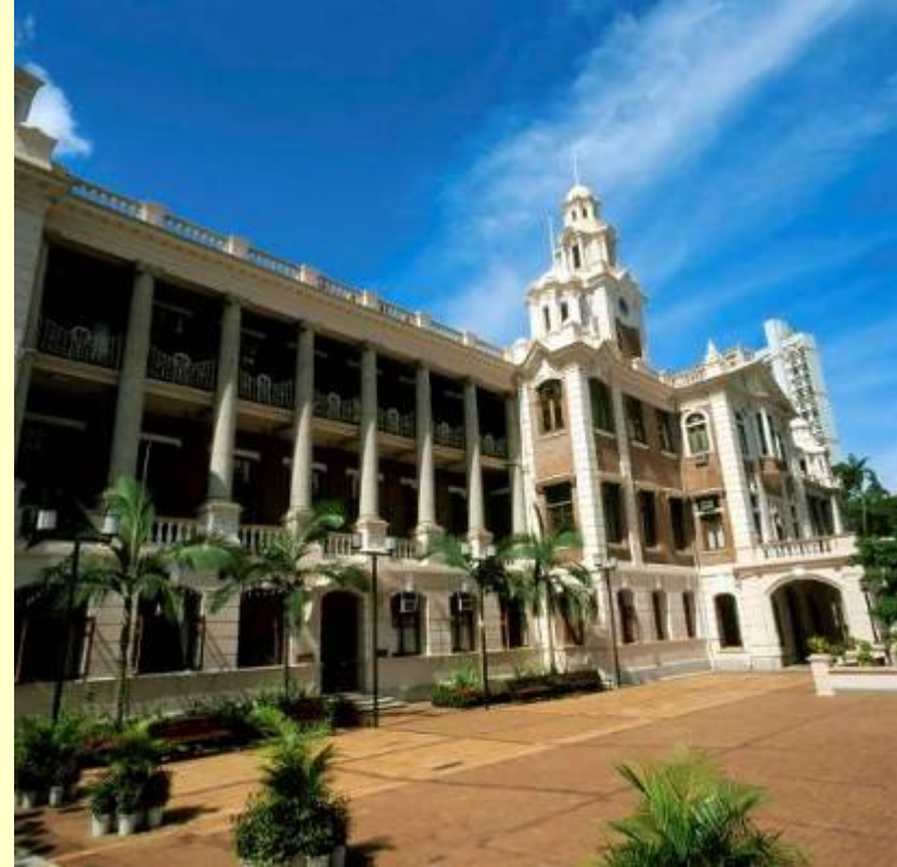
Main Building of the University of Hong Kong