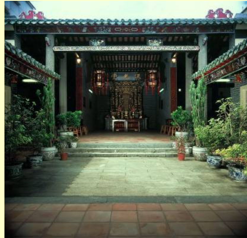
King Law Ka Shuk (ancestral hall)