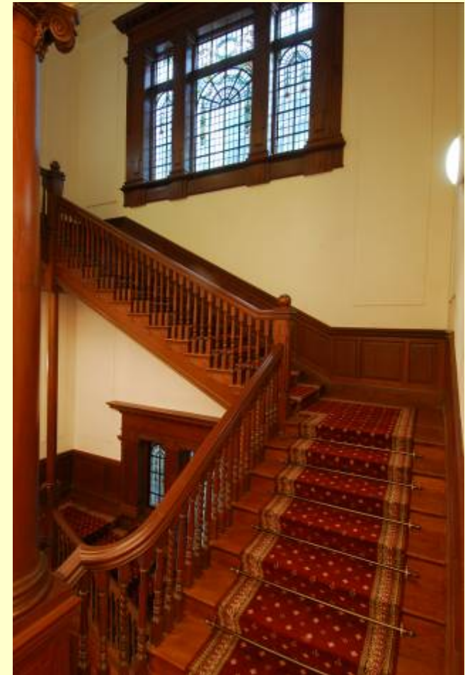
Kom Tong Hall: Converted to Dr. Sun Yat-sen Museum