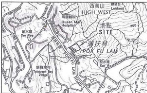
比例 Scale 1 : 20000